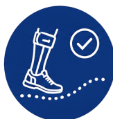
FINAL FITTING & GAIT CHECK