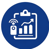
MONITOR & REPORT