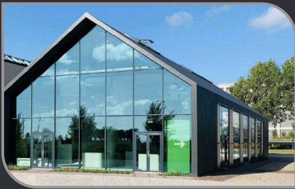
Voxelcare Experience Center Amsterdam