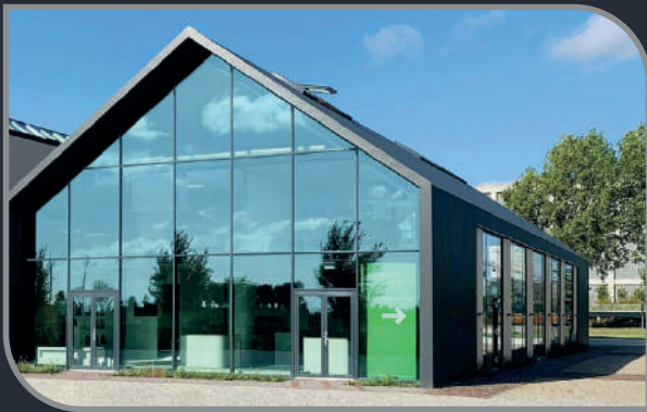
Voxelcare Experience Center Amsterdam