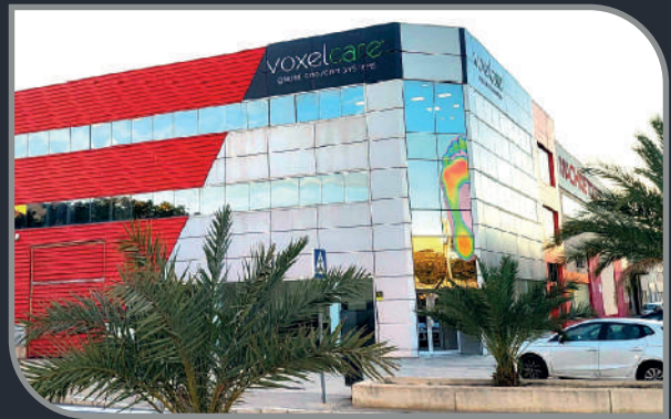
Voxelcare Headquarters & Production Alicante